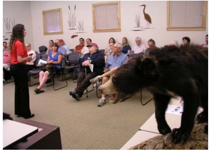
The Commission hosted a presentation about black bears during the fifth annual Pinelands Speaker Series in 2011.

sources. The students measured the levels of pH or acidity in water, as well as water clarity, temperature and dissolved oxygen. Water in the Pinelands is generally undisturbed, has a low pH and low dissolved solids, enabling it to support uniquely adapted Pinelands plants and animals. The students' findings were posted on the World Water Monitoring Day Web site ( www.worldwatermonitoringday.org ), where test results can be compared over time. In addition to assisting with the water tests, staff from the Pinelands Commission used nets to catch native Pinelands fish and demonstrated how the Commission protects wetlands and habitat for rare plants and animals.