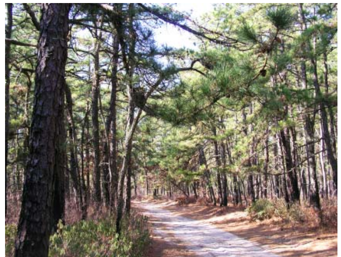
In 2011, the Pinelands Commission provided funds to help preserve the 43-acre parcel (shown above) in Medford and Evesham townships.

The Pinelands Development Credit Program is a regional transfer of development rights program that preserves important agricultural and ecological land. Pinelands Development Credits (PDCs) are allocated to landowners in Pinelands-designated Preservation, Agricultural and Special Agricultural Production Areas, which are the sending areas. These credits can be purchased by property owners and developers who are interested in developing land