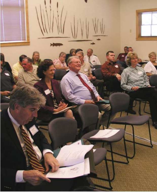
Nearly 50 people attended the Pinelands Orientation for Newly Elected or Appointed Municipal Officials in 2011. The annual event provides officials with an overview of the Pinelands Protection Program and the important role municipalities play.