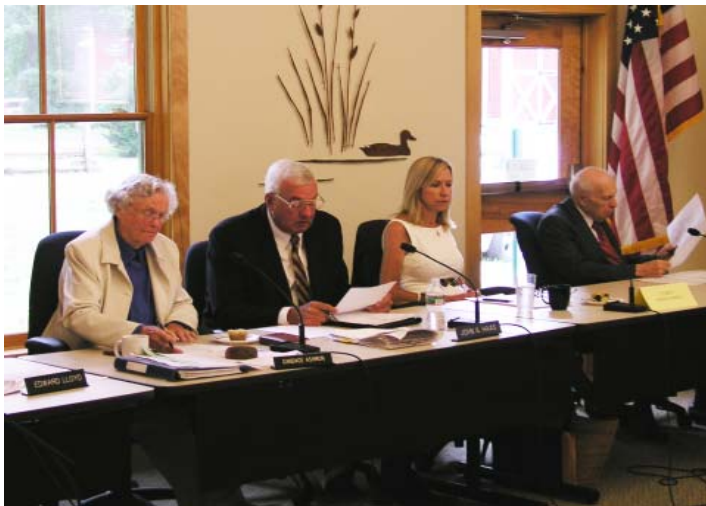
In 2011, the Commission adopted a series of rule changes that seek to ensure the environmentally-appropriate siting of solar energy facilities in the Pinelands.