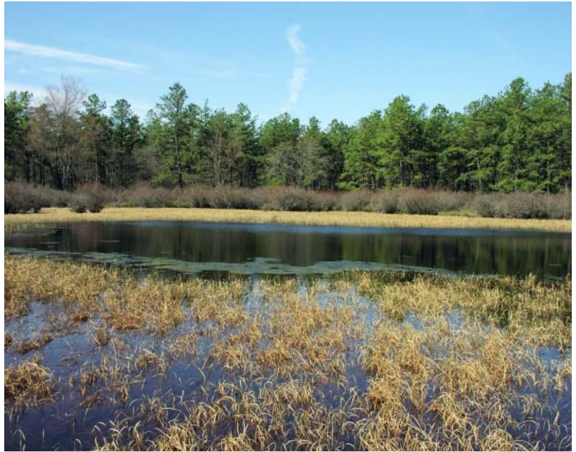
In 2011, the Commission accepted a federal grant to study the ecology of intermittent ponds such as the one above.

The Commission will supplement the EPA grant funding by contributing $116,841 from its Pinelands Conservation Fund (please see Page 4 for more information about the Fund). The project will be launched in 2012.